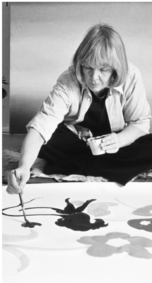
MAIJA ISOLA'S designer

Maija Isola's (1927-2001) remarkable career as a textile designer began in 1949 in Marimekko and lasted 38 years. She designed more than 500 fabric patterns. She drew inspiration for her work from traditional folk art, nature, and modern visual art alike. Her design Unikko (poppy) continue to be an essential part of Marimekko's collections.